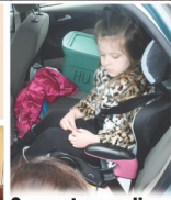
Car seats save lives

Man faces sexual misconduct with child charges A 34-year-old man from Lubbock, Texas, is facing charges of sexual misconduct with a child after a 10-year-old girl reported that he had sexually abused her. The girl's mother reported the incident to the police, and the man was arrested. He is currently in custody and facing multiple charges.