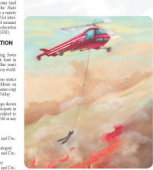
World War II-era biplane.

"Flying Saves Lives" is the theme of the 2014 International Aviation Art Contest. Artists are encouraged to create works that celebrate the spirit of aviation and the role of aircraft in saving lives.