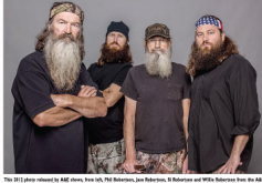
The Robertson family from the hit reality show "Duck Dynasty" includes Phil Robertson, who has been suspended from the show after making homophobic comments on the show's website.