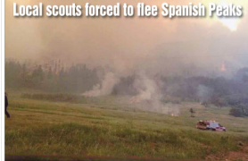
Local scouts were forced to flee Spanish Peaks after a fire broke out in the area. The fire was caused by a scoutmaster who was not following the proper procedures for a campfire.