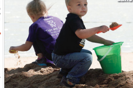
Meade Lake and park in Meade, Kan., are popular spots for families. The Meade Lake Park is a popular spot for families. The Meade Lake Park is a popular spot for families. The Meade Lake Park is a popular spot for families.

APPLY NOW The deadline for applications for the 2013-2014 fiscal year is June 30. Applications should be submitted to the Office of Management and Enterprise Services.